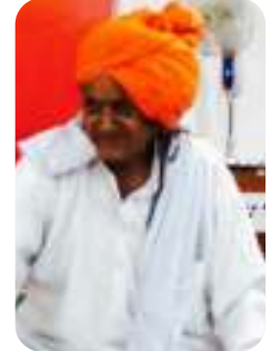
Sh Bhajan Lal ji